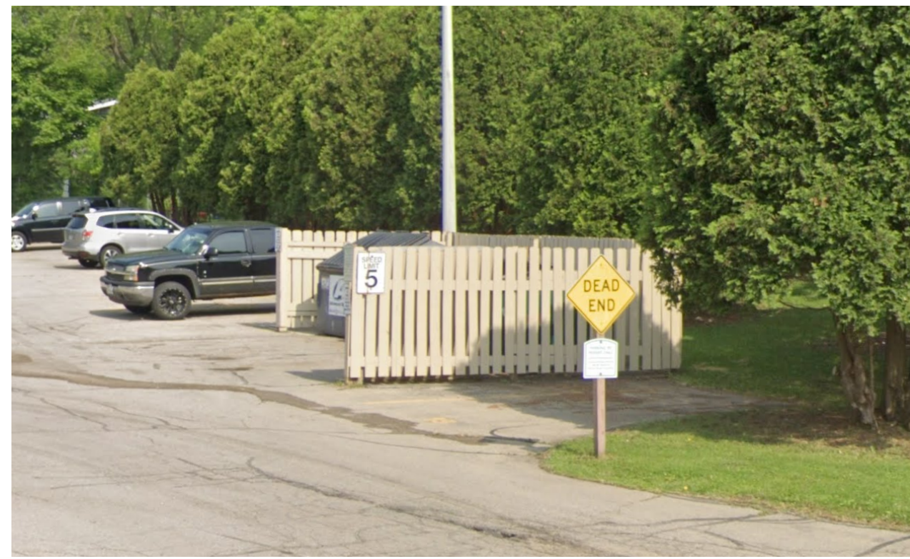
5A/A100 EXISTING TRASH ENCLOSURE

OVERALL PROJECT INFO: CONSTRUCTION TYPE: TYPE V8 (WOOD) FOUNDATION: CONCRETE (FULL BASEMENT) PARKING STALLS: 230 BIKE PARKING STALLS: 55