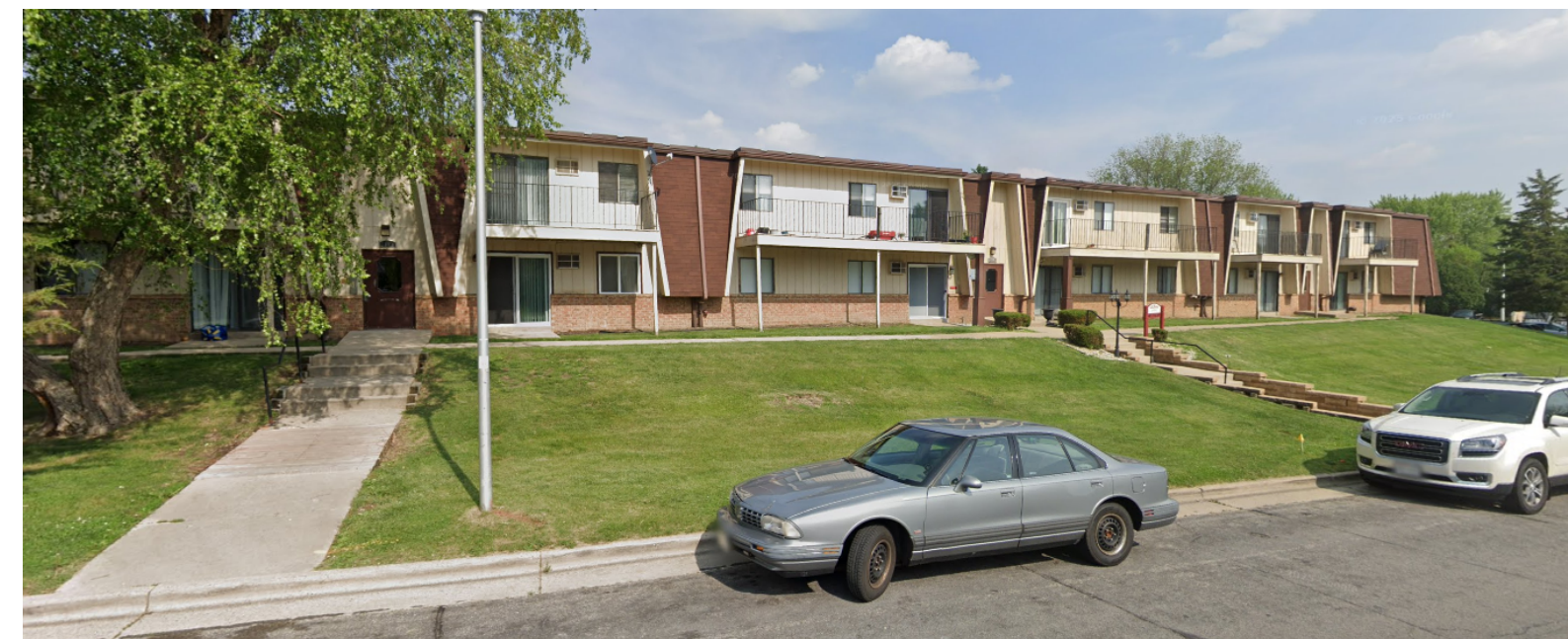
4B/A000 EXISTING - ALONG RED ARROW TRAIL 2