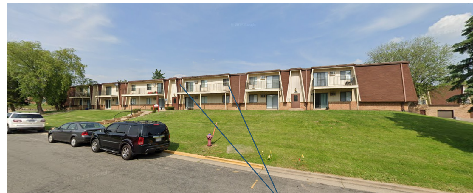
4A/A000 EXISTING - ALONG RED ARROW TRAIL 1

PROPOSED REMOVAL OF FAUX MANSARD ROOFS (TYP.)