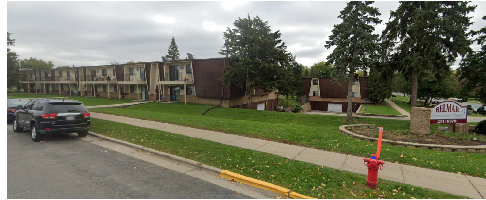
4C/A000 EXISTING - CORNER OF THURSTON LANE AND RED ARROW T