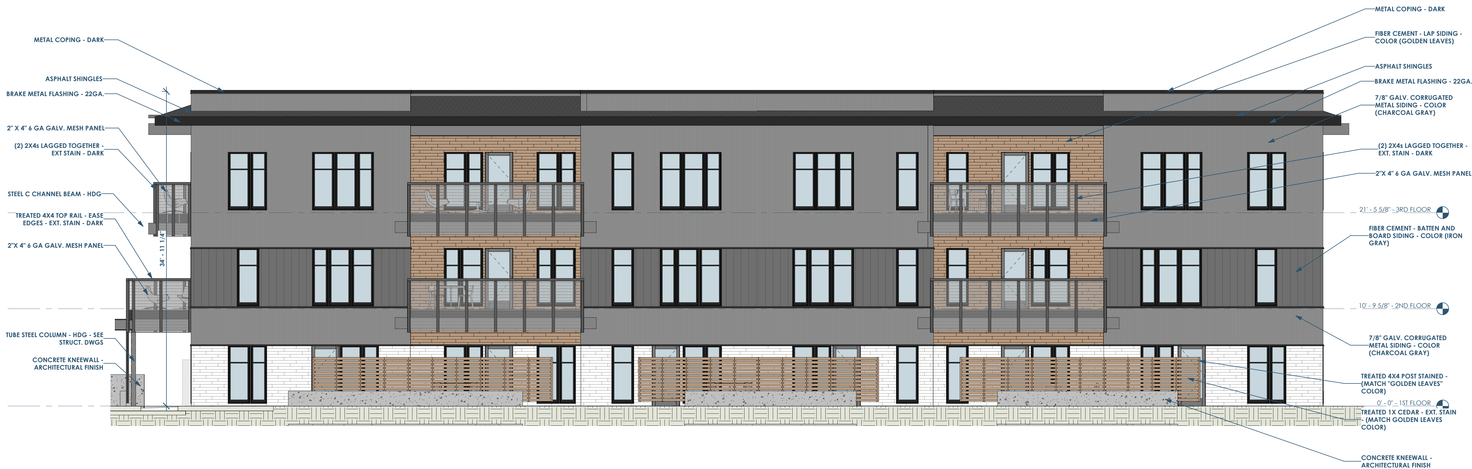
1 A22 ELEVATION - SOUTH 3/16" = 1'-0"