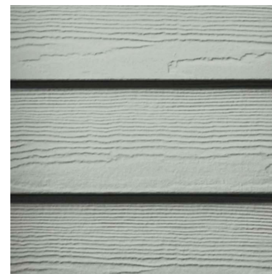
COLOR: LIGHT MIST