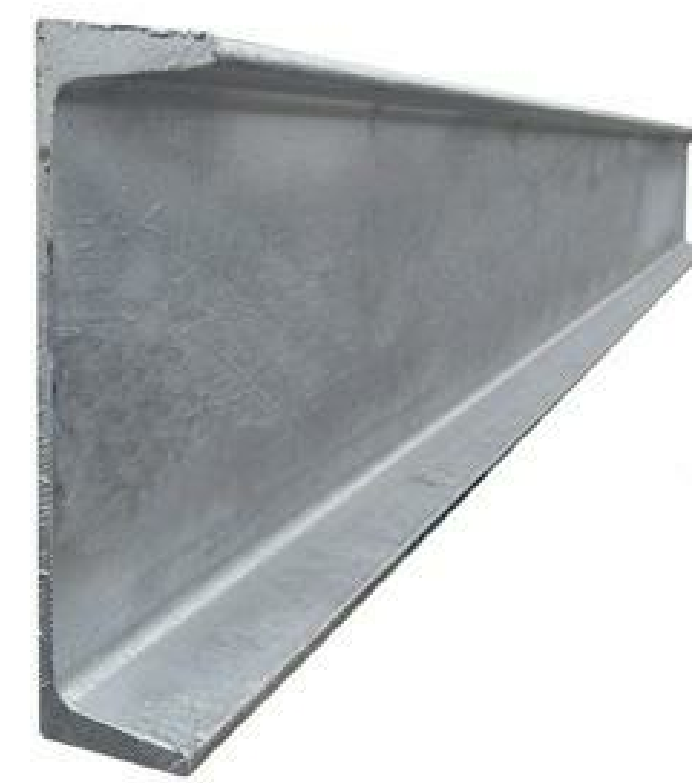
HOT DIPPED GALVANIZED STEEL