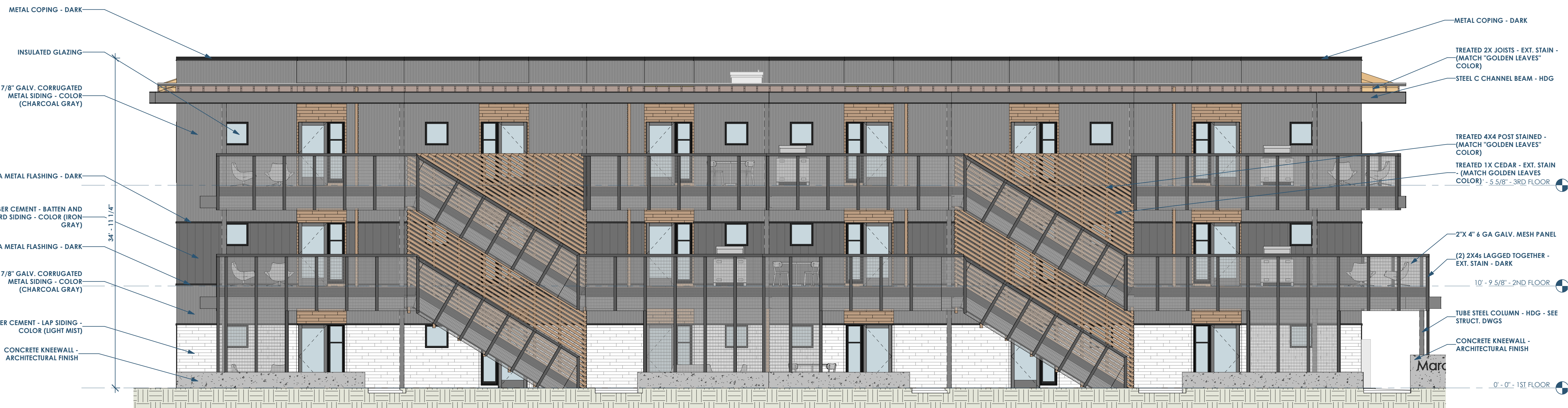
1 A20 ELEVATION - NORTH 3/16" = 1'-0"