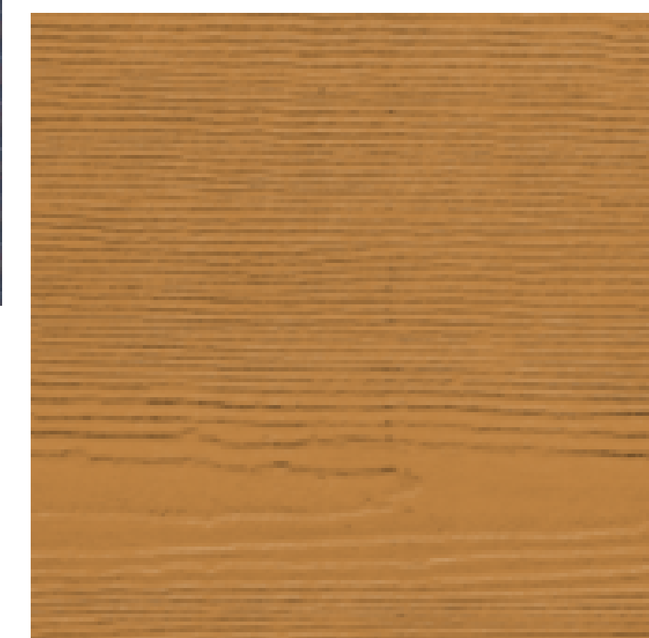
COLOR: GOLDEN LEAVES