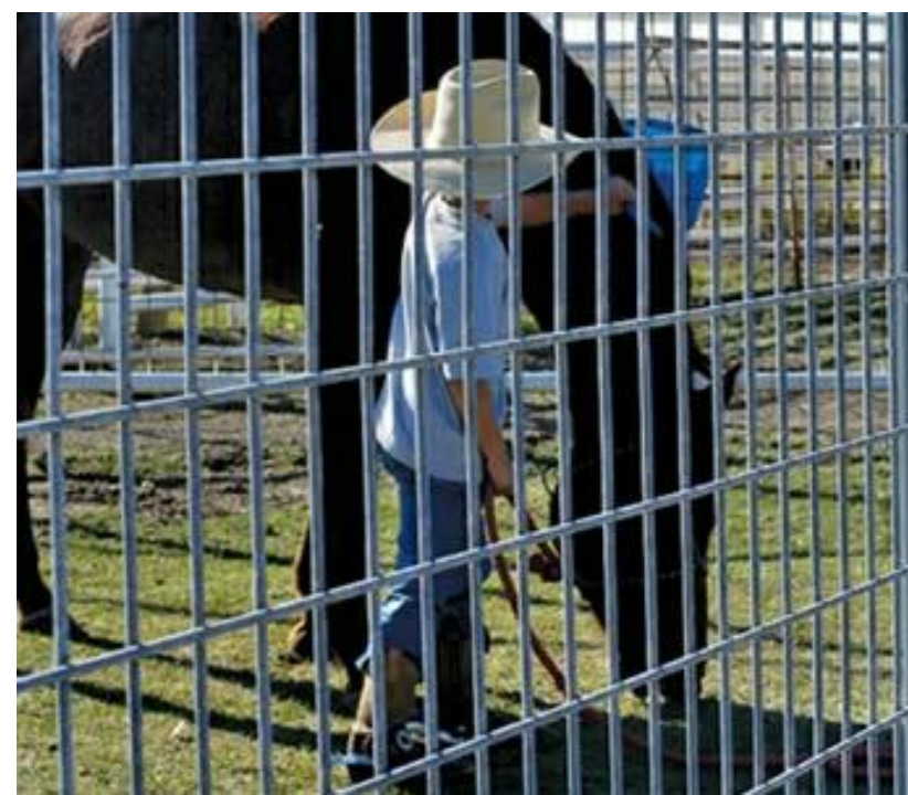
2" X 4" 6GA. GALV. MESH PANEL