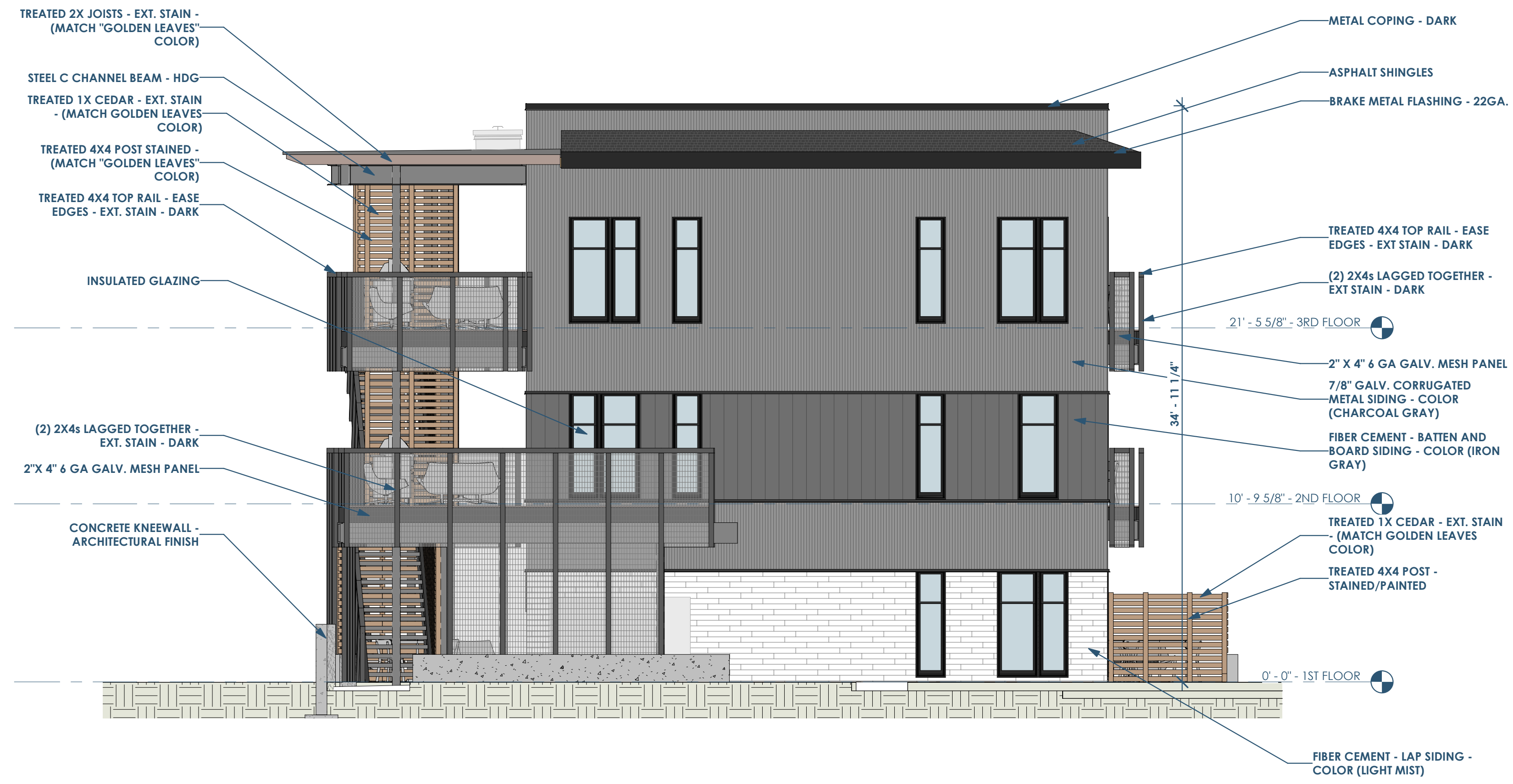
1 A21 ELEVATION - WEST 3/16" = 1'-0"