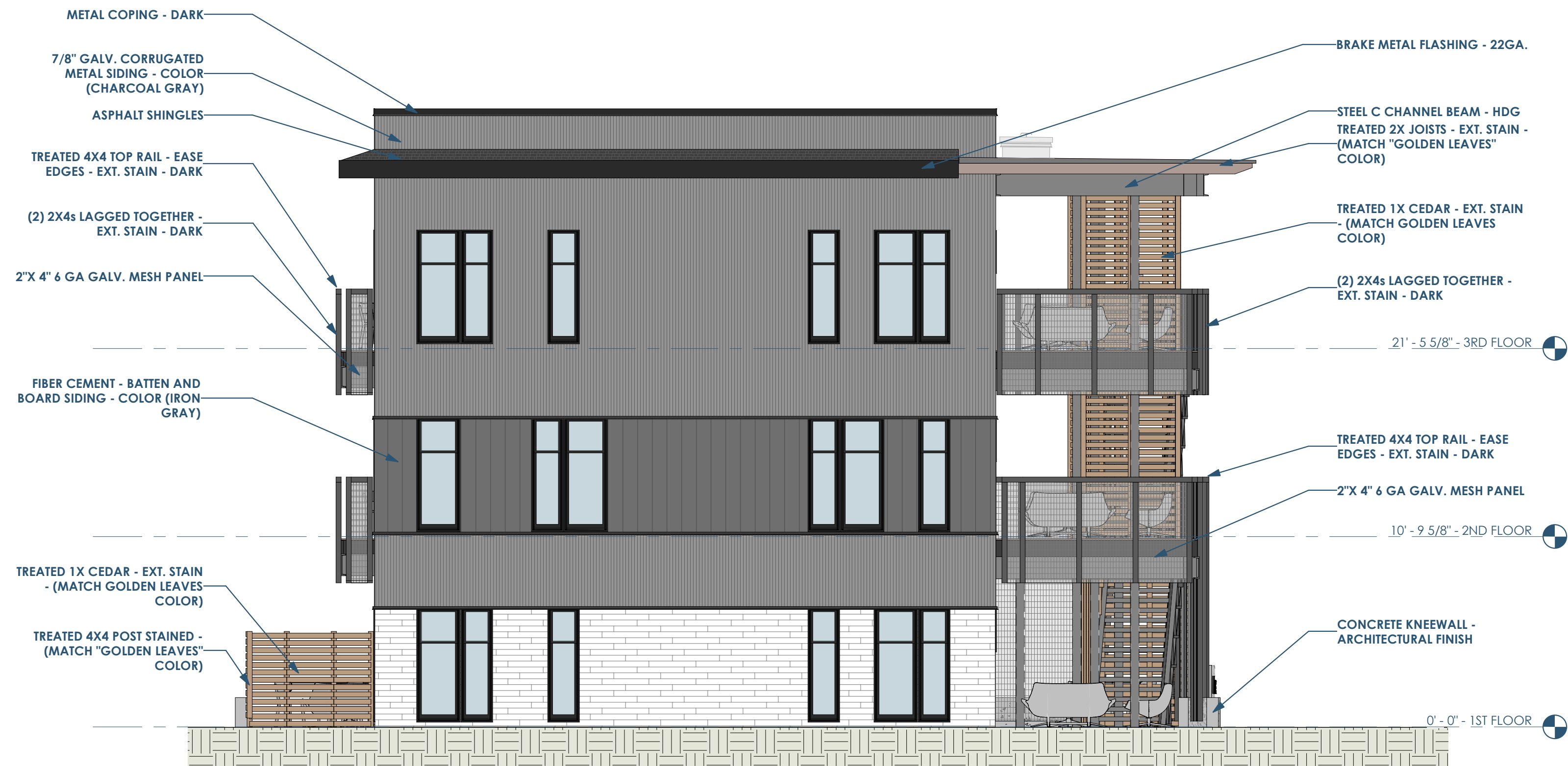
1 A23 ELEVATION - EAST 3/16" = 1'-0"