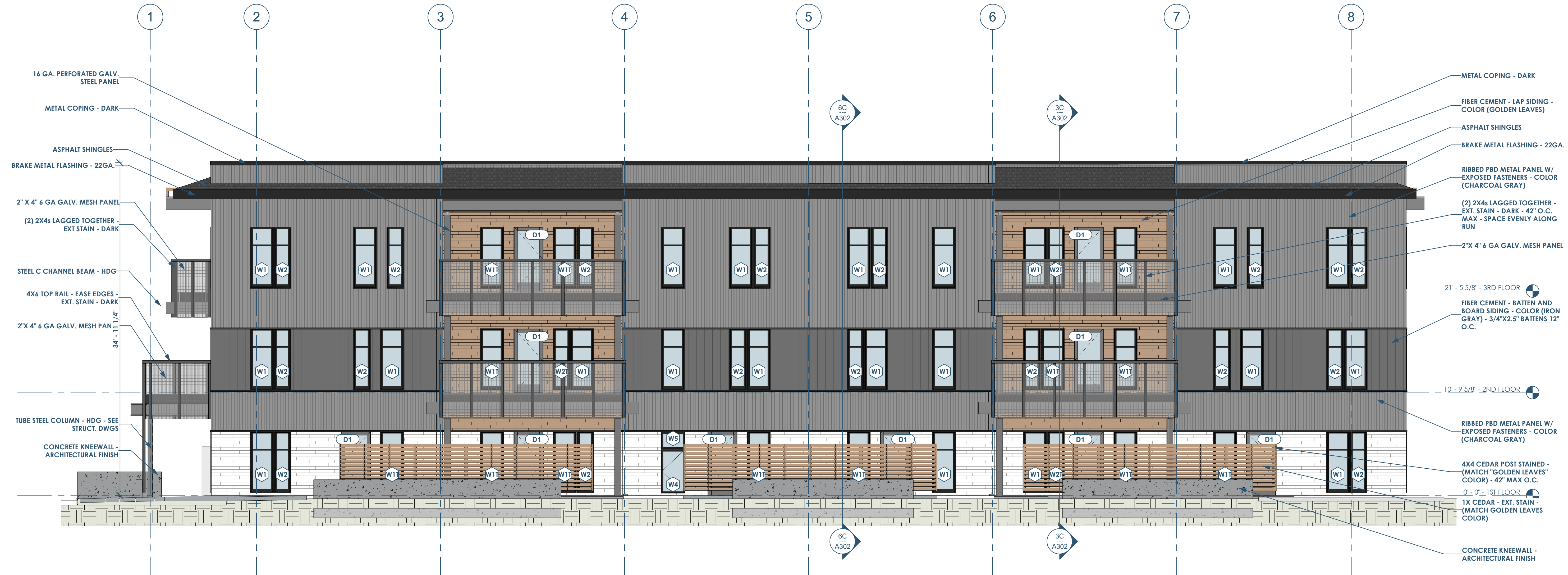
6C A201 BUILDING ELEVATION - SOUTH 3/16" = 1'-0"