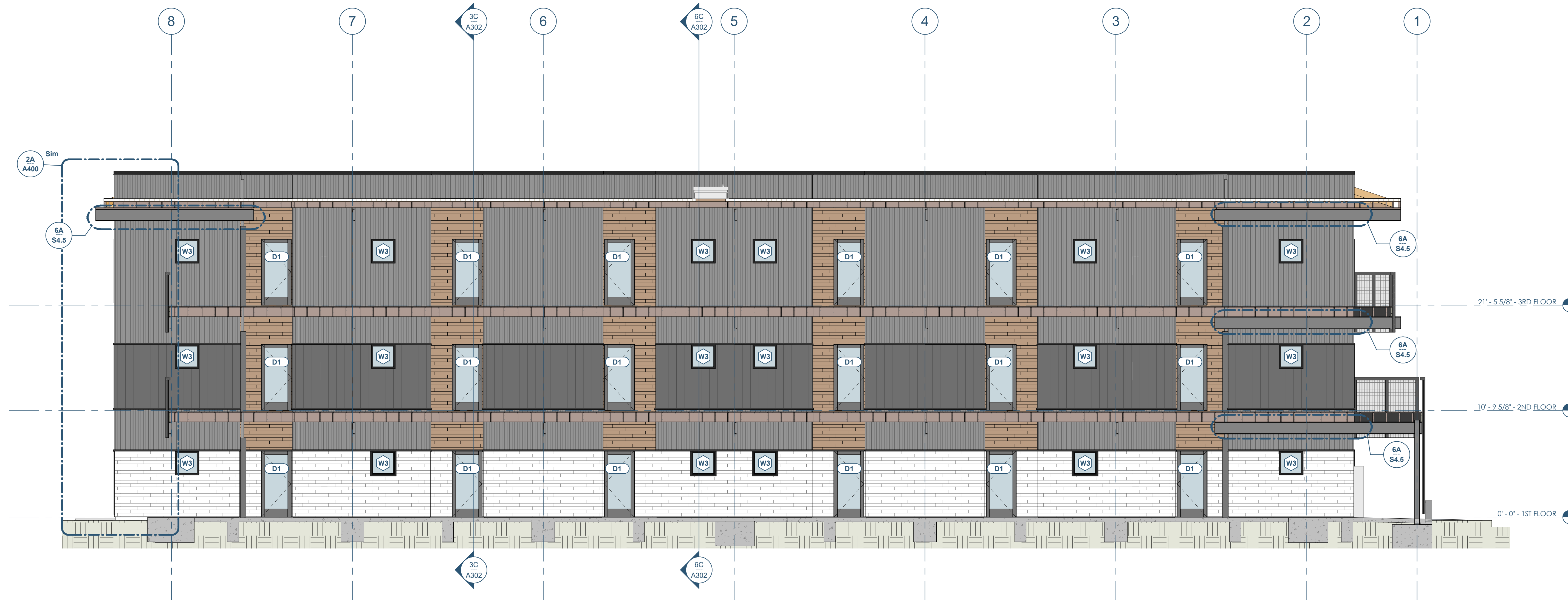
6C A301 BUILDING SECTION - THRU BALCONY - LOOKING SOUTH 3/16" = 1'-0"