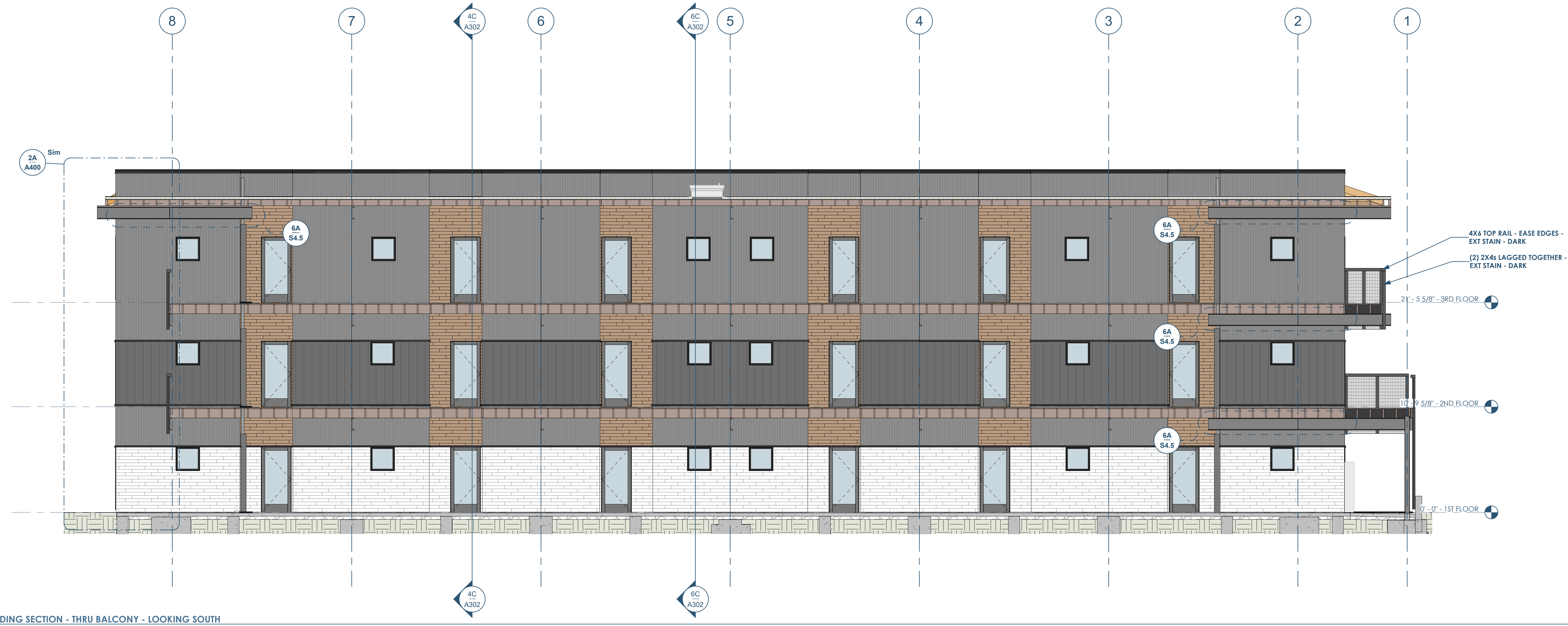
4C/A301 BUILDING SECTION - THRU BALCONY - LOOKING SOUTH 3/16" = 1'-0"

This project, like most OpeningDesign's projects, is open source (Attribution-ShareAlike 4.0 International-CC BY-SA 4.0)-freely available to any party for future use, assuming the terms such as Attribution and ShareAlike are honored.