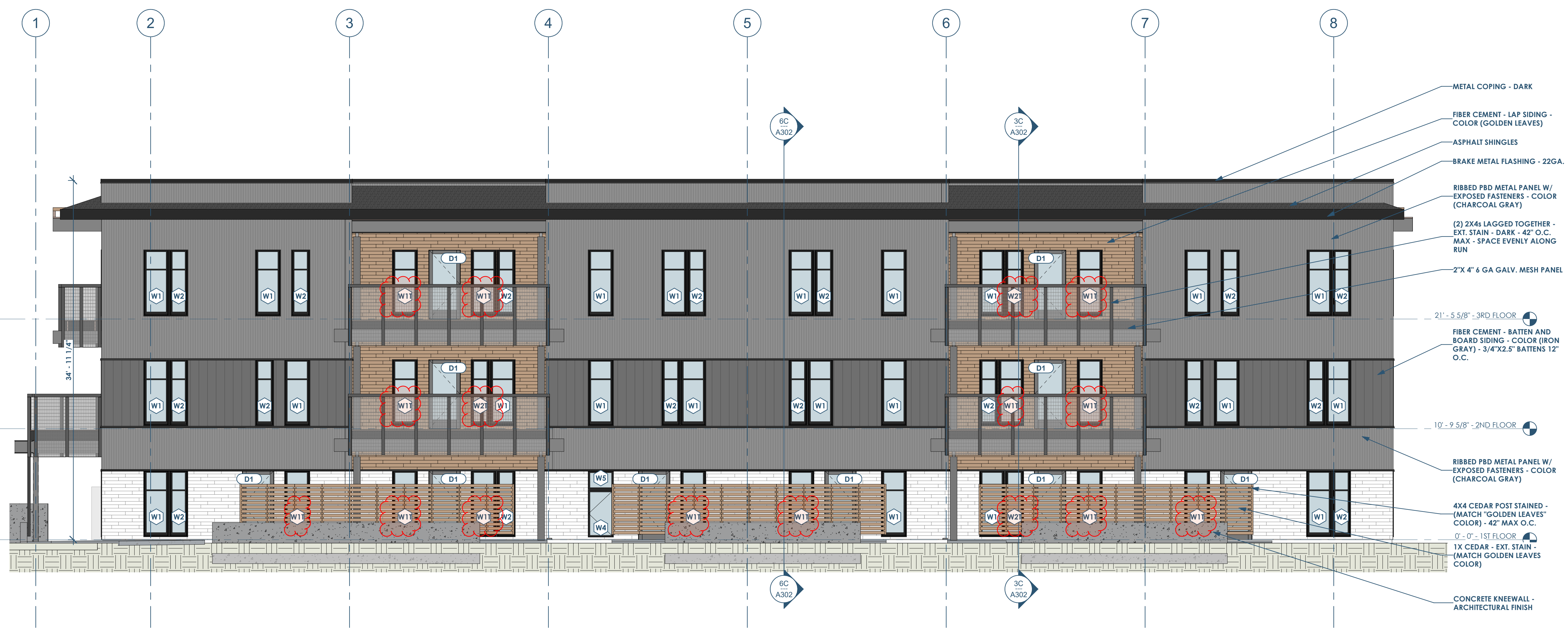
6C A201 BUILDING ELEVATION - SOUTH 3/16" = 1'-0"