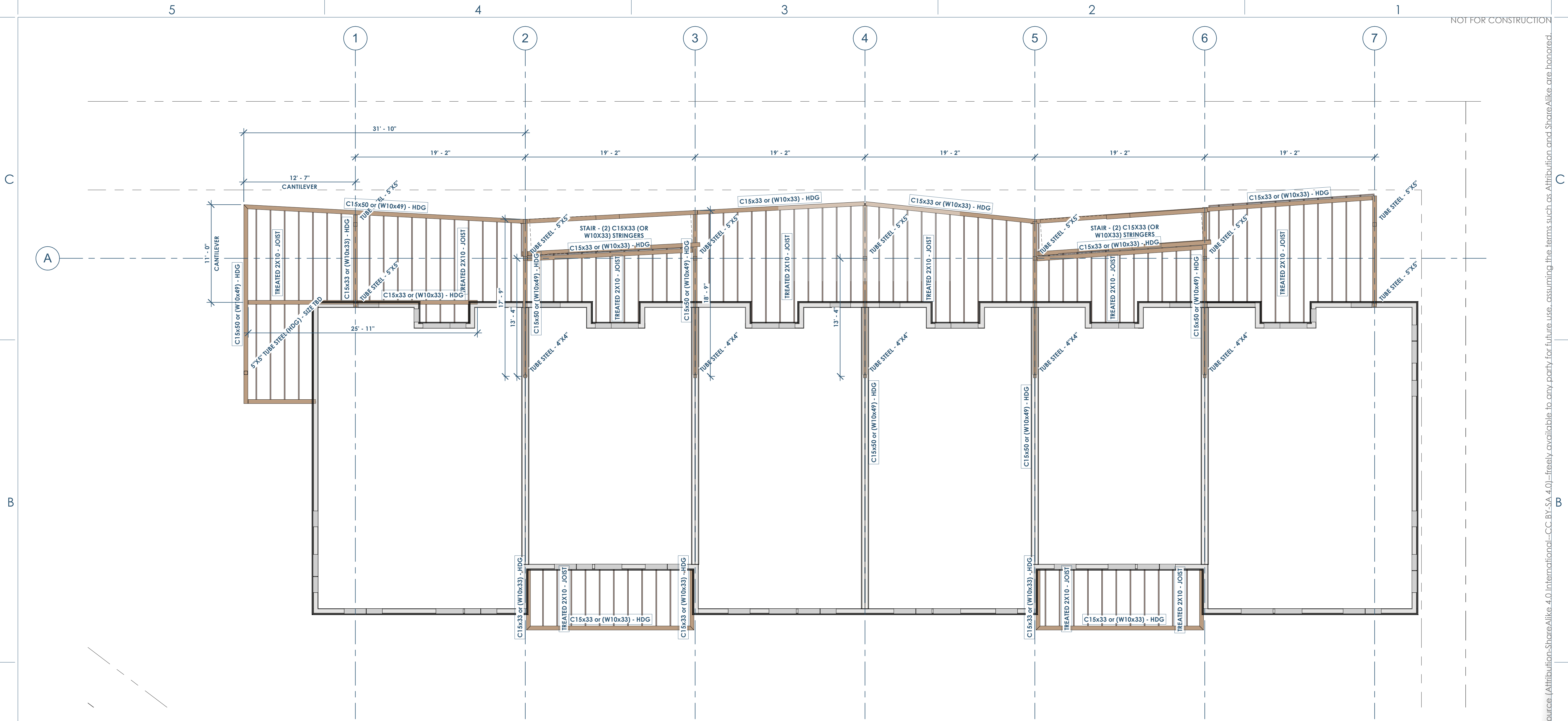
1 ST01 SCHEMATIC FRAMING PLAN - 2ND FLOOR 3/16" = 1'-0"