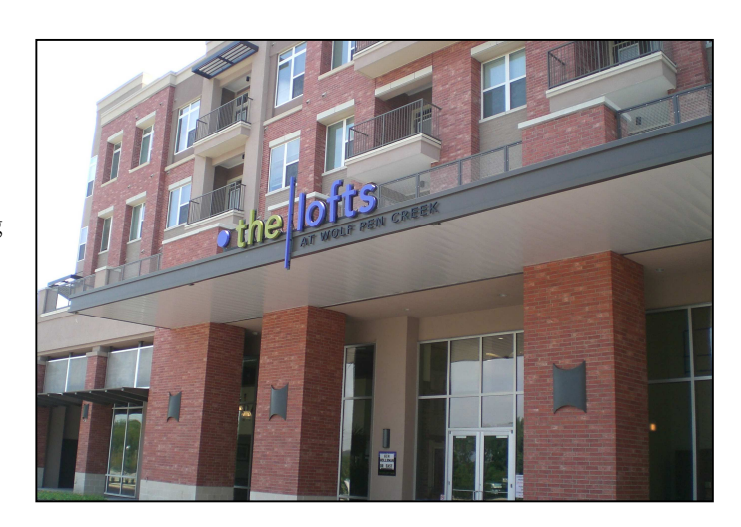
Figure 1 – Example of awning at building entrance

B. Principal building entrances shall be located under a shade device such as a building projection or recess in building face with a minimum depth of 6 feet and maximum canopy height of 20 feet.